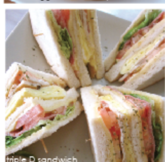
triple D sandwich