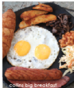
collins big breakfast

All prices prior to tax & 5% service charge