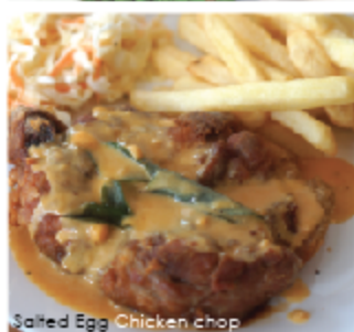
Salted Egg Chicken chop