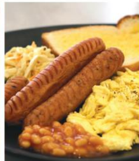
3 sausage & eggs