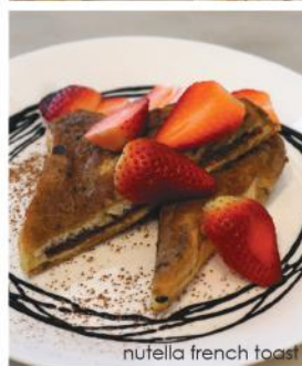
nutella french toast