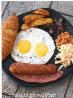
collins big breakfast