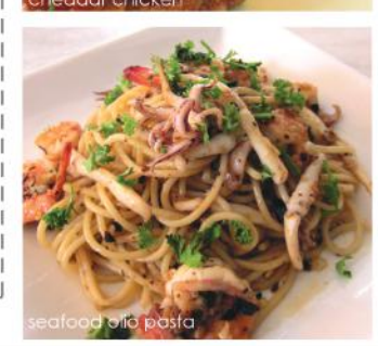
seafood olio pasta