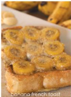
banana french toast

Choice of bread: white, wholemeal, croissant