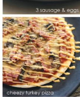
cheesy turkey pizza