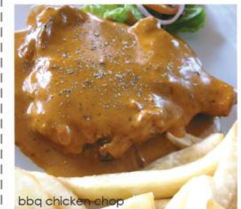
bbq chicken chop